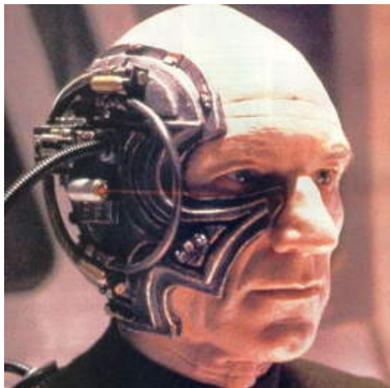
Captain Jean-Luc Picard/Locutus Borg

Being old enough to remember "Star Trek - The Next Generation" series I am finding similarities between the "New" Progressive Political movement and the Borg 'Collective'.